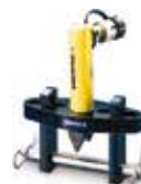
Pin-Type Flange Spreaders