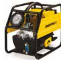
Electric Torque Wrench Pumps