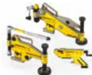
Flange Alignment Tools