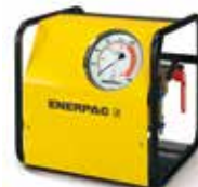
Pneumatic Tensioning Pumps