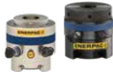
Topside Bolt Tensioners