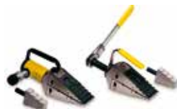
Step-Type Flange Spreaders