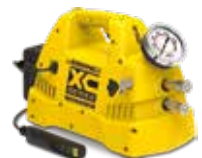
Battery-Powered Torque Wrench Pumps