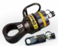
Hydraulic Nut Cutters and Nut Splitters