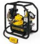
Pneumatic Torque Wrench Pumps