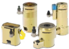
Power Generation Bolt Tensioners