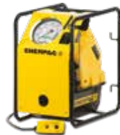
Electric Tensioning Pumps