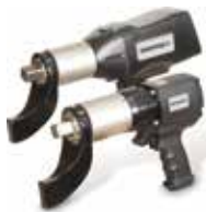
Pneumatic and Electric Torque Wrenches