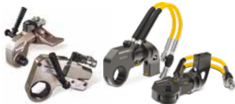
Hydraulic Torque Wrenches