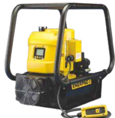
ZE-Series, Electric Pumps

9618GB © Enerpac 11-2018. Subject to change without notice.