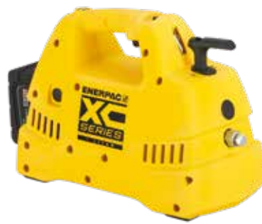
XC-Series, Battery-Powered Pumps