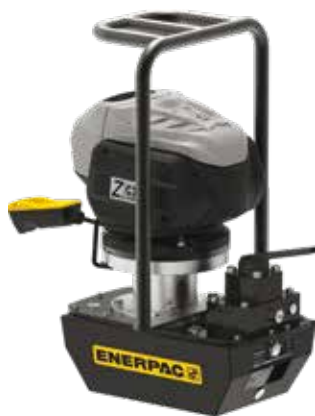
ZC-Series, Battery-Powered Pumps