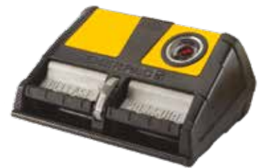
XA-Series, Air Driven Pumps