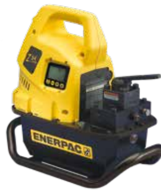
ZU4-Series, Portable Electric Pumps