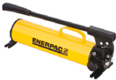
P-Series, Hand Pumps

Enerpac hydraulic pumps are available in over 1000 different configurations. Whatever your application needs are for speed, control, intermittent or heavy-duty, Enerpac has the right solution for you. Featuring Hand, Battery, Electric, Air and Gasoline-powered models, Enerpac offers the most comprehensive pump line available.